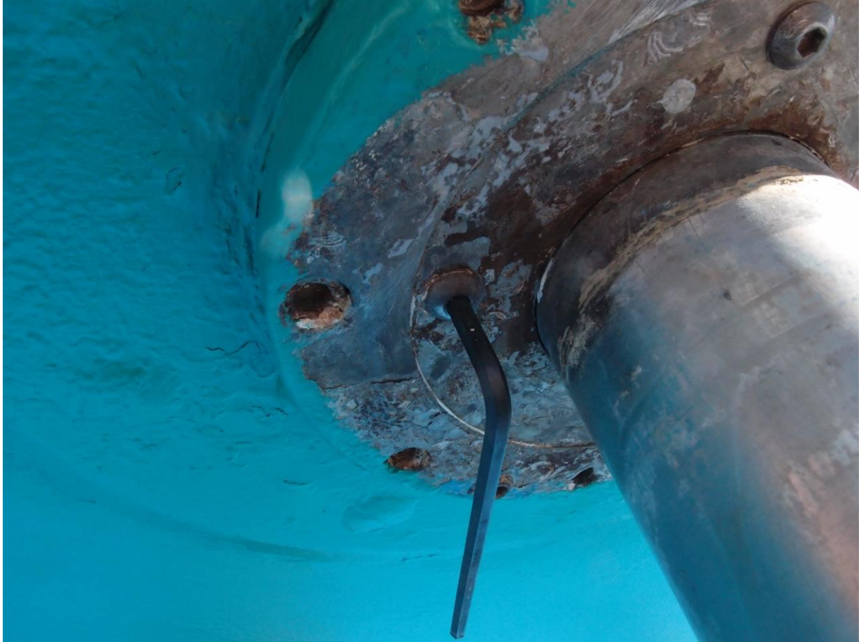
Figure 10: removal of seal cover (inner ring - outer ring is the bearing cover)