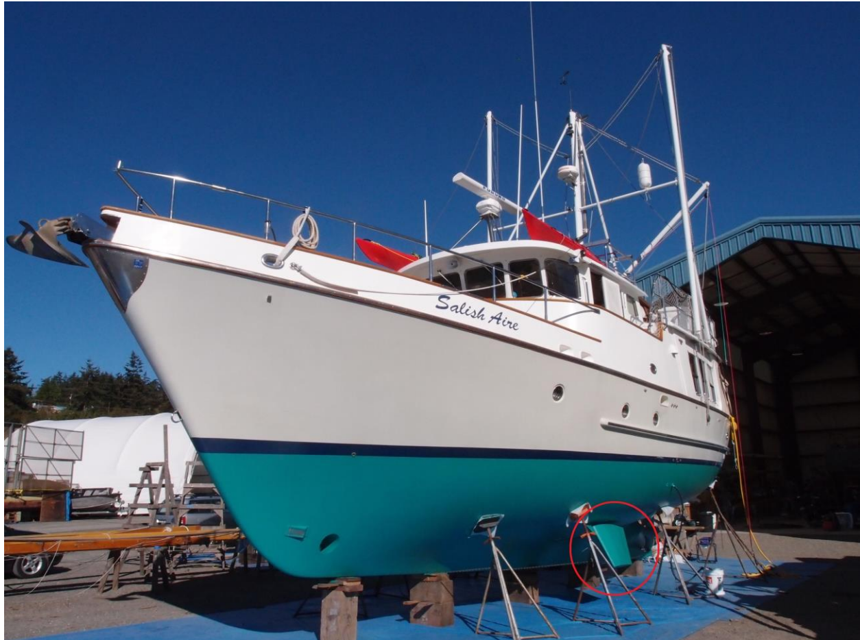
Figure 1: Naiad port side fin circled in red

One of the primary reasons for lifting the boat in September of 2016 was to do a full evaluation and service of our Naiad hydraulic stabilizer system.