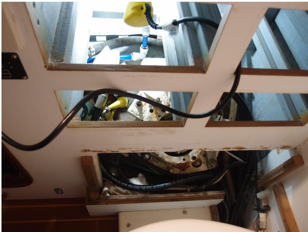
Figure 8: Partially disassembled Stbd side unit - access is a bit more of a challenge as it is under the vanity in the aft head

The fins were removed with the manual screw-in tool purchased from Naiad. This is a screw with a socket fitting at one end but I was told by a Naiad company technician at a boat show to not even think about trying to make one as they are specially hardened and if the threads should strip on a home built model the repair costs can be a couple thousand dollars. The first step of the fin removal process is to remove the bolt that holds them on. This takes a 1 3/8 socket, a long extension, and a breaker bar plus a pipe capable of breaking loose a bolt that is initially tightened to 300 ft lbs. Once the bolt is removed the removal tool is threaded into threads in the fin and then tightened until the fin pops loose from its taper fit shaft by pushing on the end of the shaft. In preparation for the sudden drop of the fin blocks are put under it leaving a small bit of free space above the top block. We tightened the tool with a 3/4 drive breaker bar plus about 2 1/2 feet of iron pipe for a leverage extension. The good news is that the tool works much better than we expected and we had both fins down in a short time. (The guy from Haven commented that it was also much tidier than using the hydraulic tool).