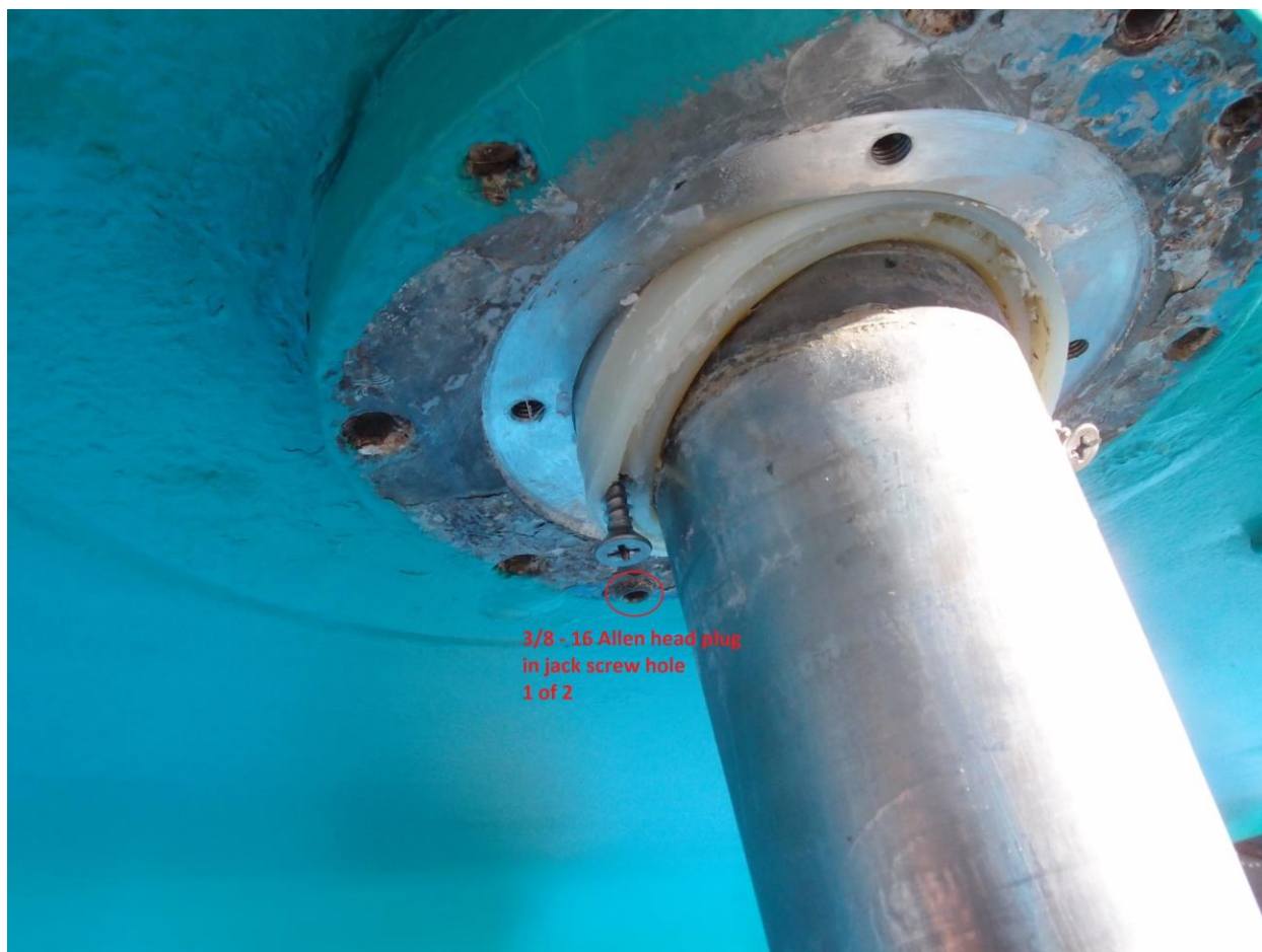
Figure 11: Showing removal of seals using screws (2 stacked seals both with lips down). Also showing location of one of the jack screw holes used to force the bearing cover off.