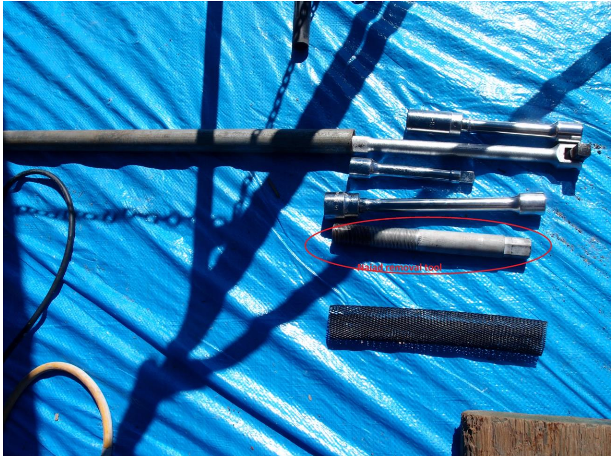
Figure 9: Tools used to remove fins including 3/4 drive breaker bar and extension pipe, 1 3/8 socket, 12 in extension, and Naiad removal tool (circled)

I had watched carefully when the outer seals were replaced in 2014 and so getting them out was pretty straight forward. They are held in place with a cover which is held in with 4 Allen screws. To get the seals out (they are a stacked set of 2) the recommended plan is to drive a long sheet metal screw into both sides of the seal and it will walk itself out. Next is the bearing cover which is held in by several more Allen screws. Since the cover tight fits into a lip in the main casting of the fin assembly it would be really difficult to get out if it weren't for two 3/8 -16 drive screw holes provided by Naiad engineers. The holes are filled with Allen set screws which are removed and then bolts (I used grade 8 to avoid any chance of stripping the threads) are driven into the holes which pushes the cover out. My only concern so far is in finding that the bottom of the main casting has rusted and chipped away a bit. Since the pressure seal is really in the lip there is not a concern it will leak but I am still trying to think of a way to keep it from deteriorating more.