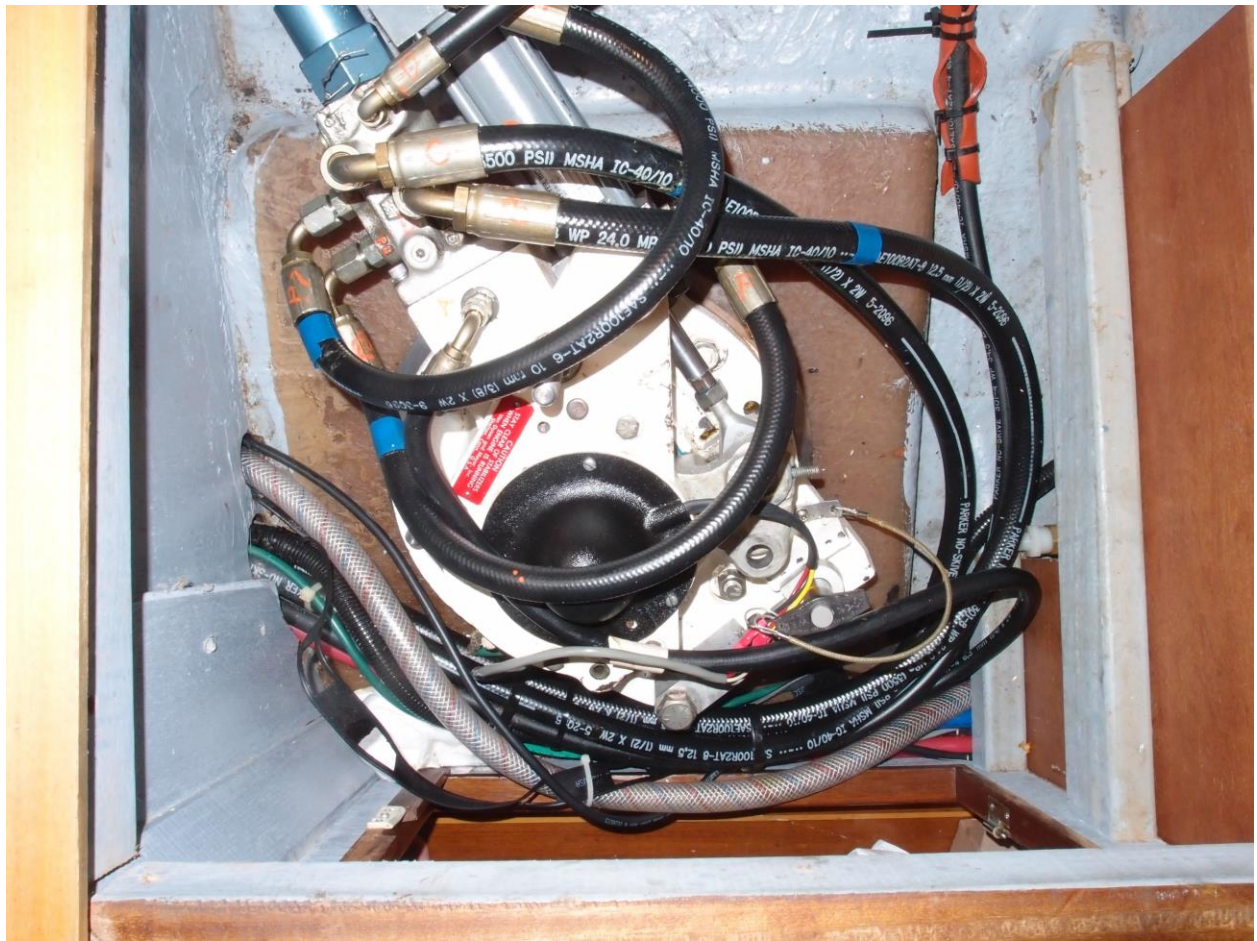
Figure 7: Fully assembled upper end port side.