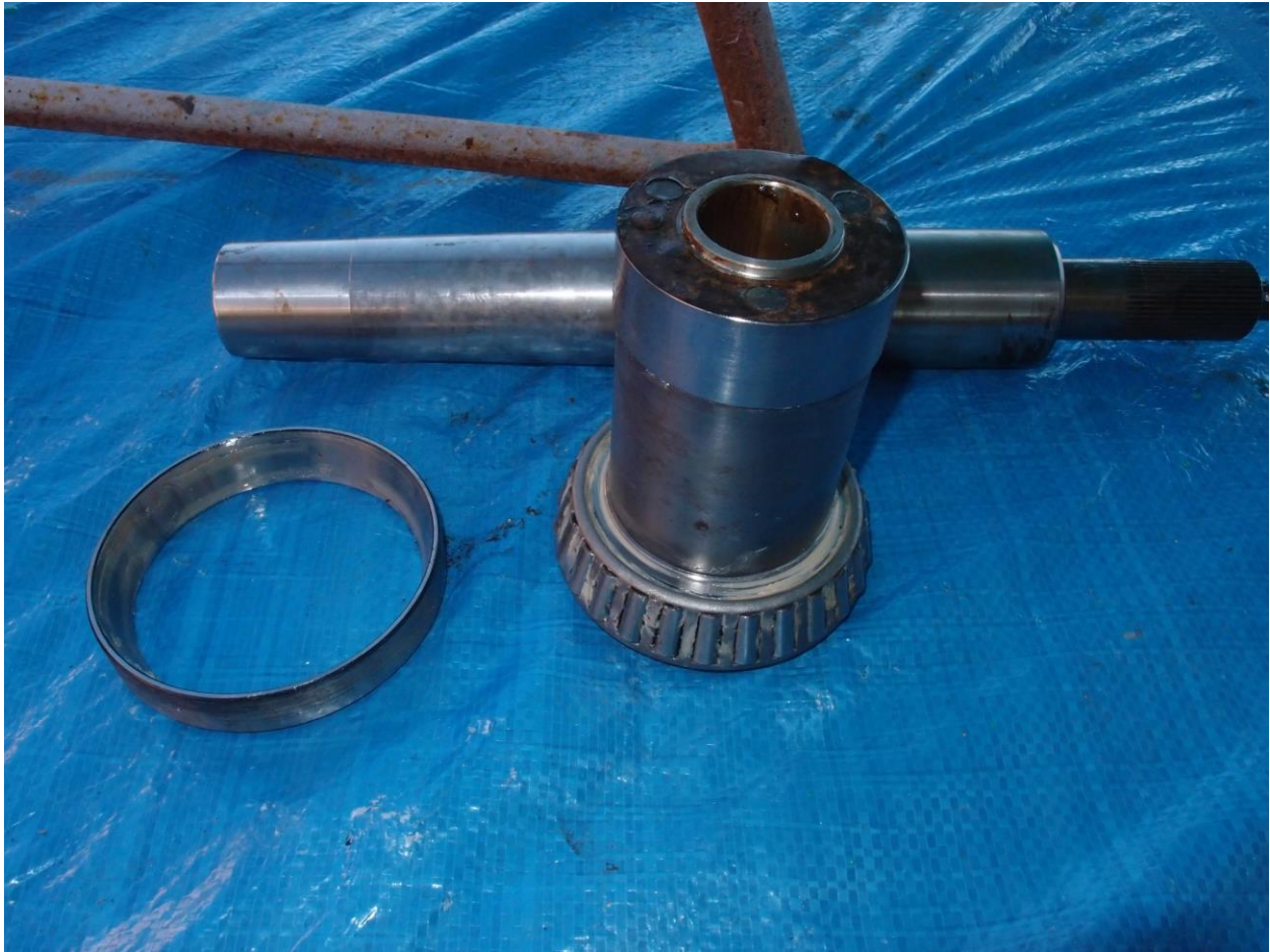
Figure 12: Main shaft that comes out first; bearing shaft with the lower bearing still in place and one of the 2 bearing races. (There is a lip on the bearing shaft that is not visible in this photo that makes it impossible to remove the lower bearing without taking it up the full length of the shaft and off of the top end).

under the boat and one into the boat. Now it was just a matter of wiping out about a pint of white grease so that the reassembly process can begin.