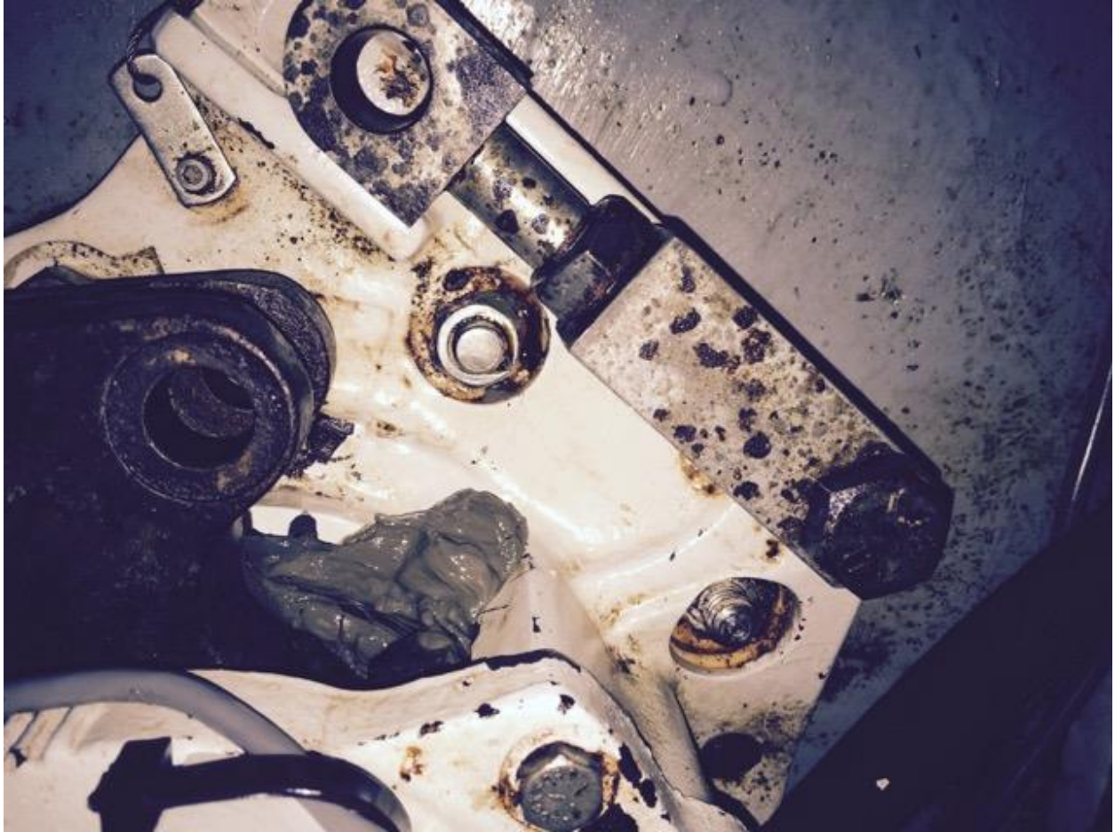
Figure 2: (NOT Salish Aire) - but an example of grease being forced out of the actuator into the boat as a classic warning sign of water intrusion below

We looked for a boat yard that had a mechanic that was 1) familiar with the Naiads, and 2) willing to let me do whatever work I can both to save money and to learn about how to repair them myself in the future.