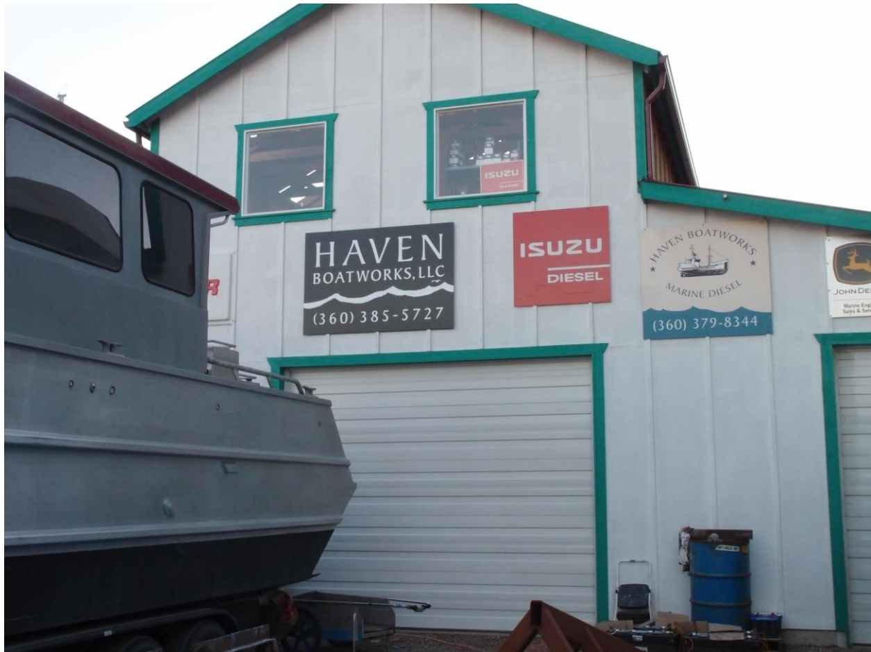
Figure 3: Haven Boatworks in Port Townsend Washington had a mechanic familiar with Naiads who was willing to act as my mentor

Prior to even getting to the boat yard I contacted Naiad with a list of parts that I think should pretty much repair / replace anything that is likely to have aged or failed. Initially I was told by Naiad that they normally don't sell this level of parts to a boat owner but after our yard folks called and spoke to them they agreed to sell to me directly. The parts came to about $3000 (see the breakdown at the end).