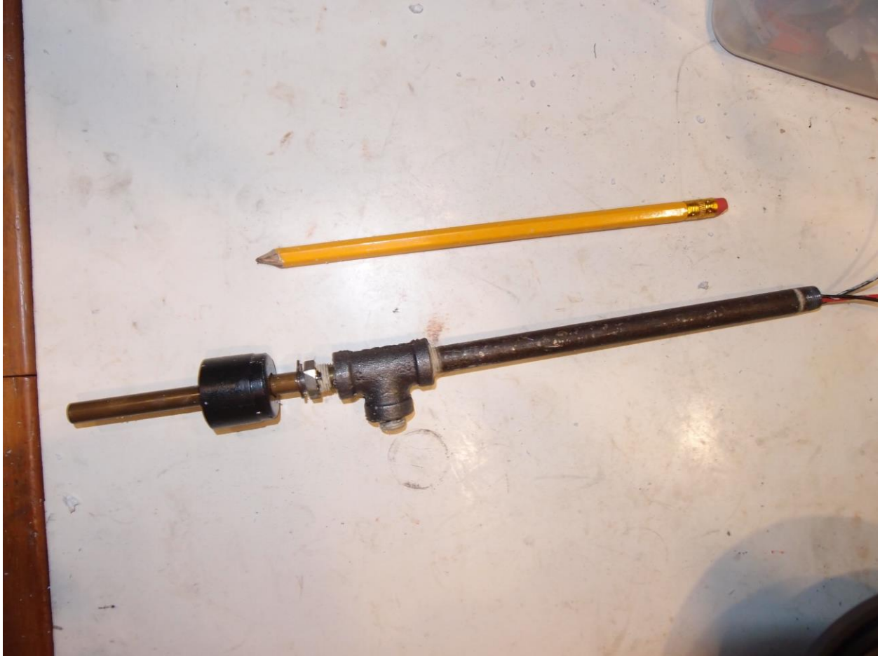
Figure 5: sender unit with oil level and over temp sensors that goes in the center of the reservoir

I had previously replaced the seals in the leaking hydraulic pump and replace the high and low pressure hoses from the pump to the reservoir. I was able to source the replacement parts kit from the internet as this is a common industrial pump. A local bearing supply dealer had a replacement rubber insert for the drive coupling.