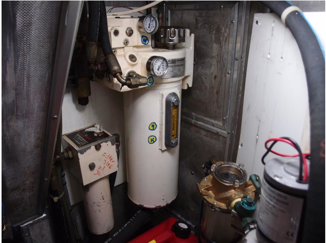
Figure 4: Naiad reservoir with new thermometer / level sight gauge installed